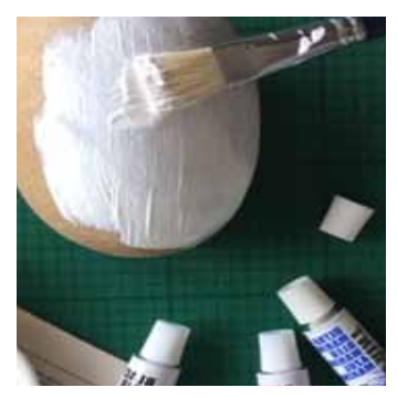
1. Find a pebble or smallish stone that is rounded in shape. This one is about 9cm in height. Scrub it off with a brush and pat dry.