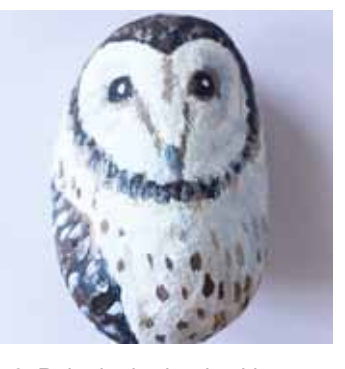
6 . Paint in the beak with a darker grey. Finally making little strokes across the chest area with light brown, dark brown and grey for shadow. Your Barn Owl is finished!