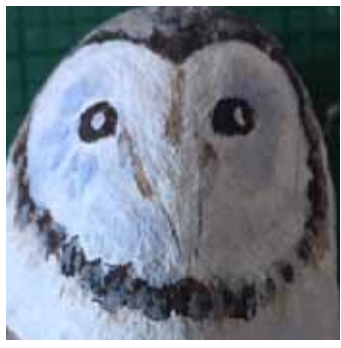
5 . Use a light brown for the feathers around the beak and face. Carefully paint the white into the eyes using your small paintbrush. Mix together white with a little blue for the shadows on the face