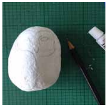
3. When completely dry using your Barn Owl picture for reference (or use this final picture) draw your Barn Owl using your soft pencil. I started with the eyes and face.