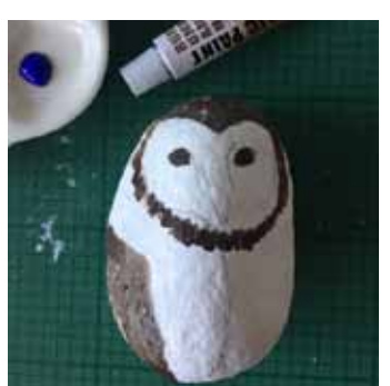
4. Using your small paintbrush and brown paint your feathers on the wing and face. Then carefully paint in your eyes using black.