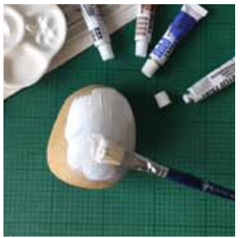
2. Mix up some white acrylic paint in a little pot or saucer. Using your large paintbrush cover it all over with paint. Wait for it to dry then give it another coat of white paint.